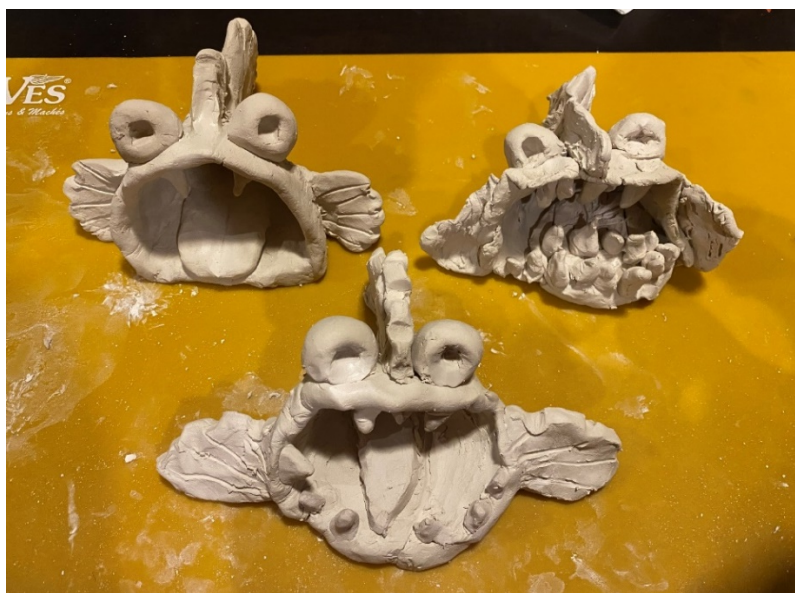
Examples of how your project might turn out! Adult, (top left) 6-year-old, (top right) 9-year-old (front).

Clean-up! Warm water & soap will take that dry clay off your hands really fast! Paint your creature! .....and probably order more Critter Clay! www.avesclay.com